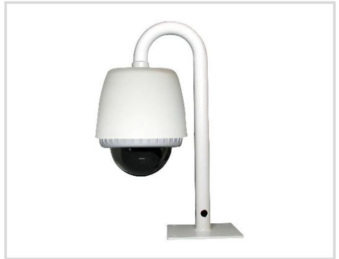
The dome housing is not part of delivery