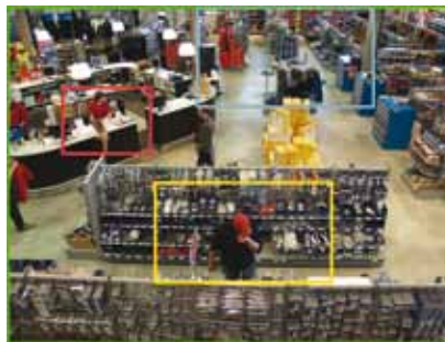
Full overview enabling cropped view areas