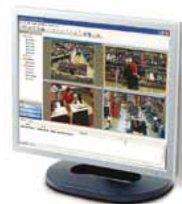
Multiple virtual camera views (up to eight views possible)